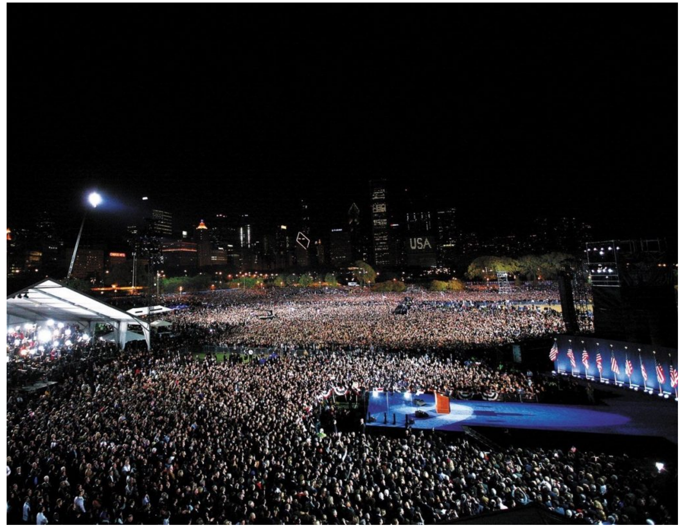
Obama's Election Night Event in 2008