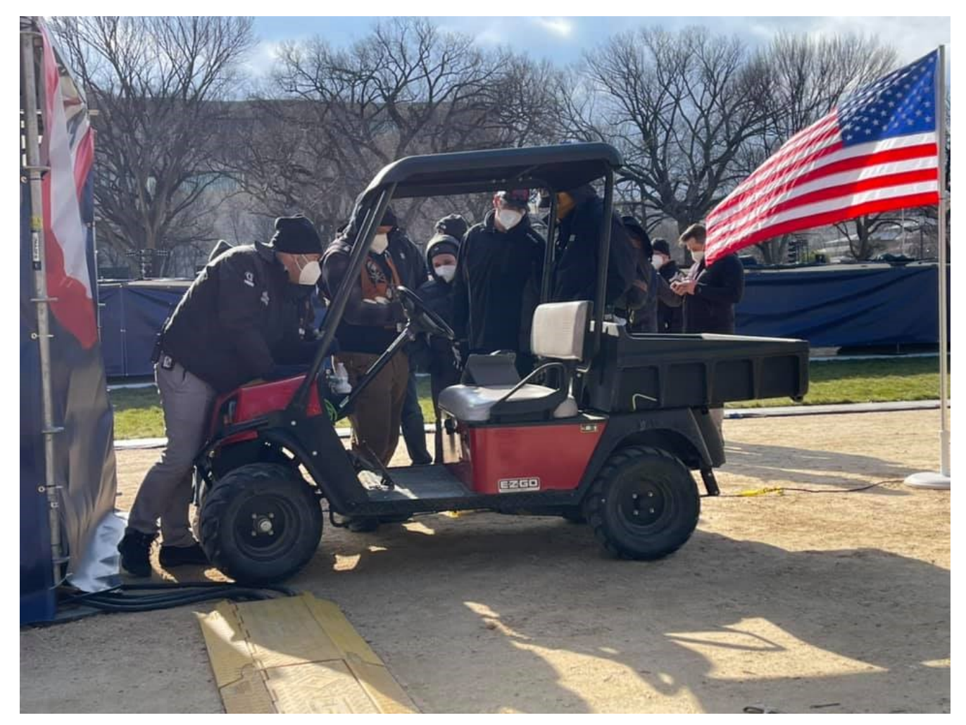
The Field of Flags Crew Watching the Inauguration Live from their IPad