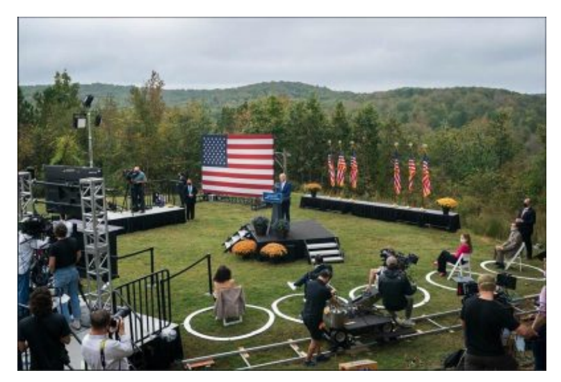
A 2020 Biden Rally, with Social Distancing Pods

We cover how they were able to adjust their business and their events once the pandemic hit, how they made their 2020 political events & rallies COVID-Safe, and go into detail on what it was like working the Inauguration with the extra security measures, cold weather, and reuniting with their longtime friends and colleagues. We also hear about what they're up to now and what they are looking forward to later in 2021.