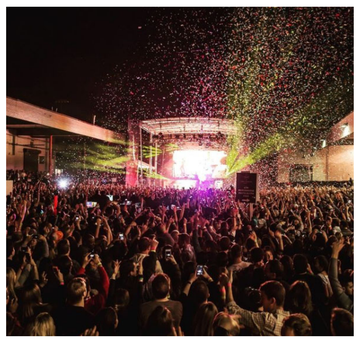
All Things Go Music Festival — Washington DC