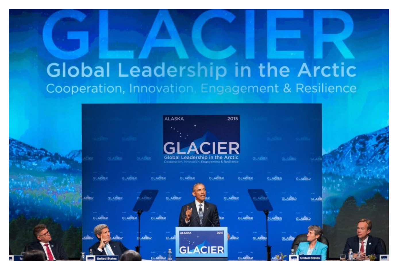
GLACIER Summit in Alaska