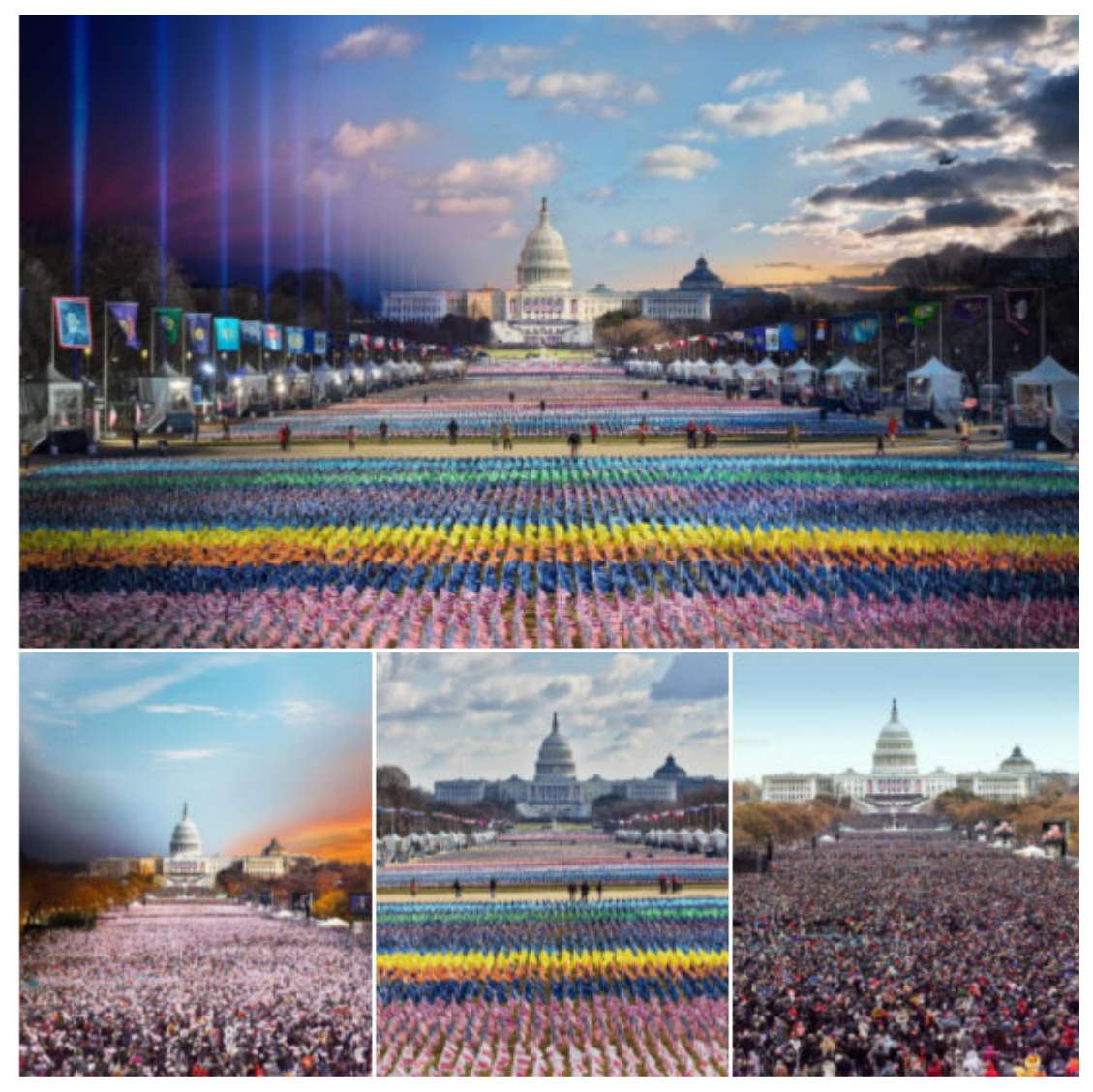
The 2013 and 2021 Inaugurations