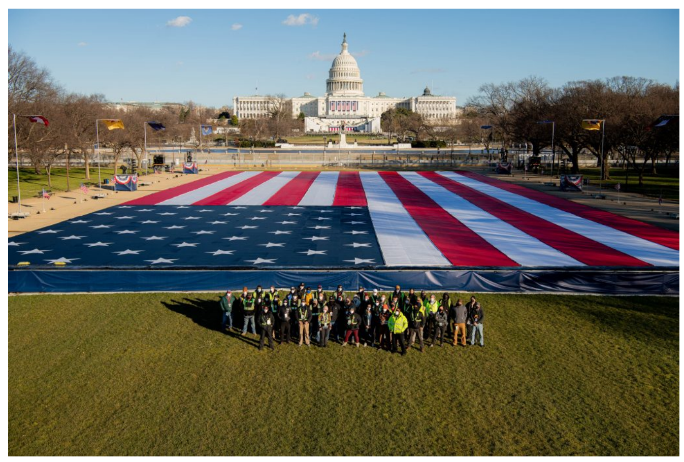
The C3 and Front Runner Productions Teams at the 2021