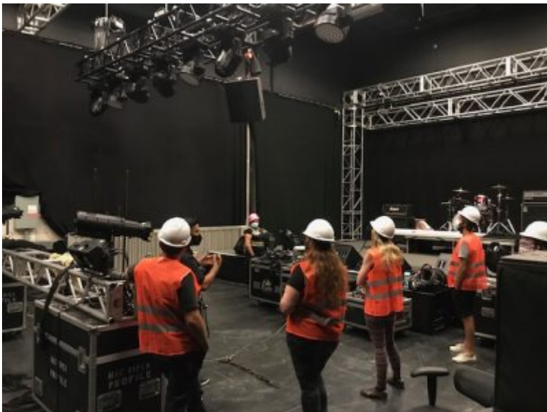
Learning how to tie rigging knots