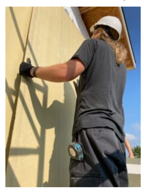
Hanging up siding at a HFH house in Austin

• Habitat for Humanity. You can work either at a job site building a home or at their ReStore retail outlet stocking shelves. The site leaders are very patient with those new to home construction and will guide you on how to use all power tools and other gear.