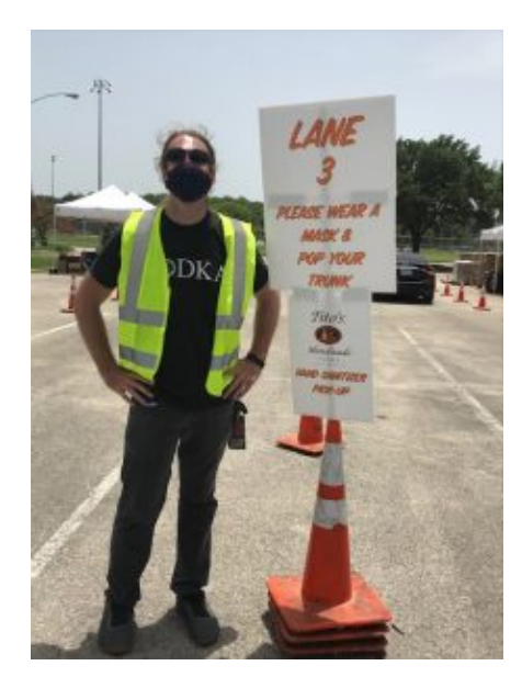
Working a Tito's Hand Sanitizer giveaway in Texas

There may even be paid opportunities to help others impacted by the pandemic, such as the role I had helping distribute tens of thousands of hand sanitizer bottles through <u>Tito's</u> throughout Texas this past summer or the polling work described above.