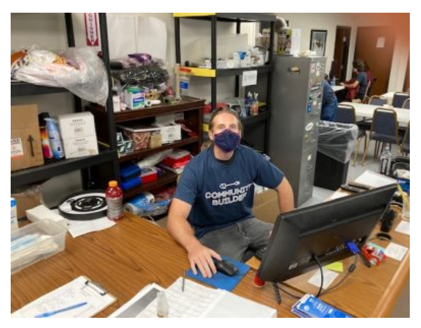
Manning the front desk at The Other Ones' headquarters at Camp Esperanza in Austin

• Homeless organizations. In Austin, we have <u>The Other</u> <u>Ones</u> who help provide our homeless neighbors with paying jobs, showers, food, case workers, and much more. You can help at their front desk or outside checking people in who want a shower.