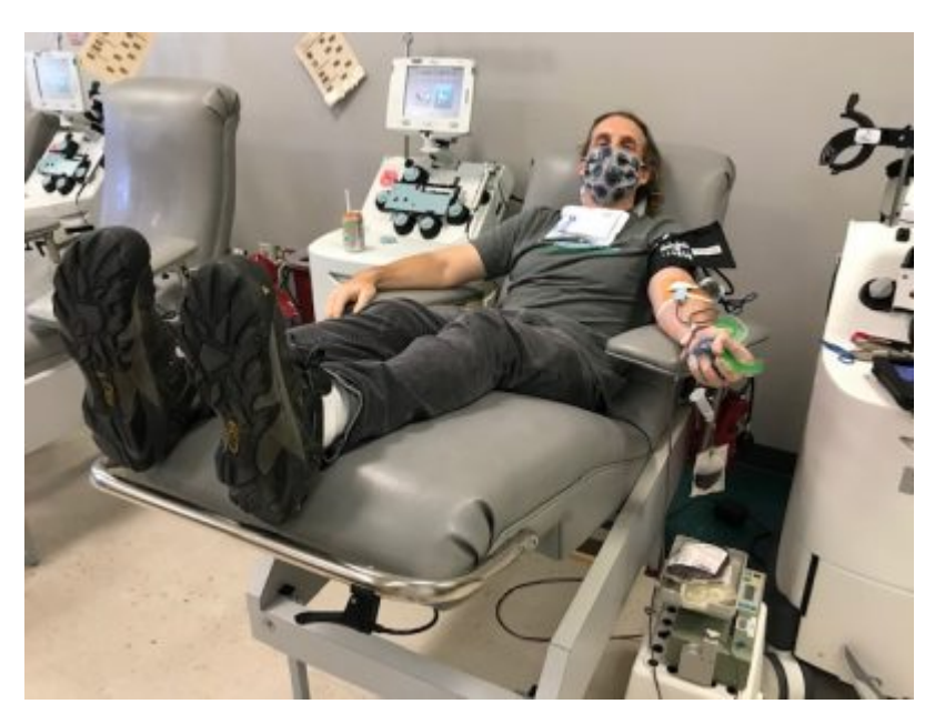
Giving blood in Austin at We Are Blood

• Homeless organizations. In Austin, we have <u>The Other</u> <u>Ones</u> who help provide our homeless neighbors with paying jobs, showers, food, case workers, and much more. You can help at their front desk or outside checking people in who want a shower.