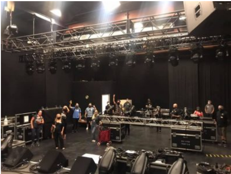
Our inaugural workshop class

When registration is open again, we will update this page. We can't wait to do this again!