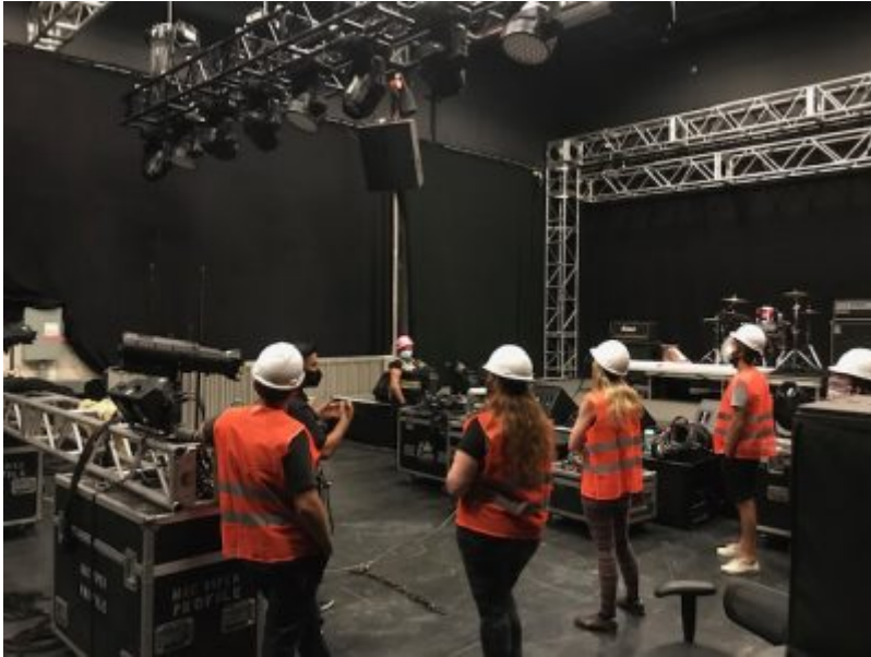
Learning how to tie rigging knots