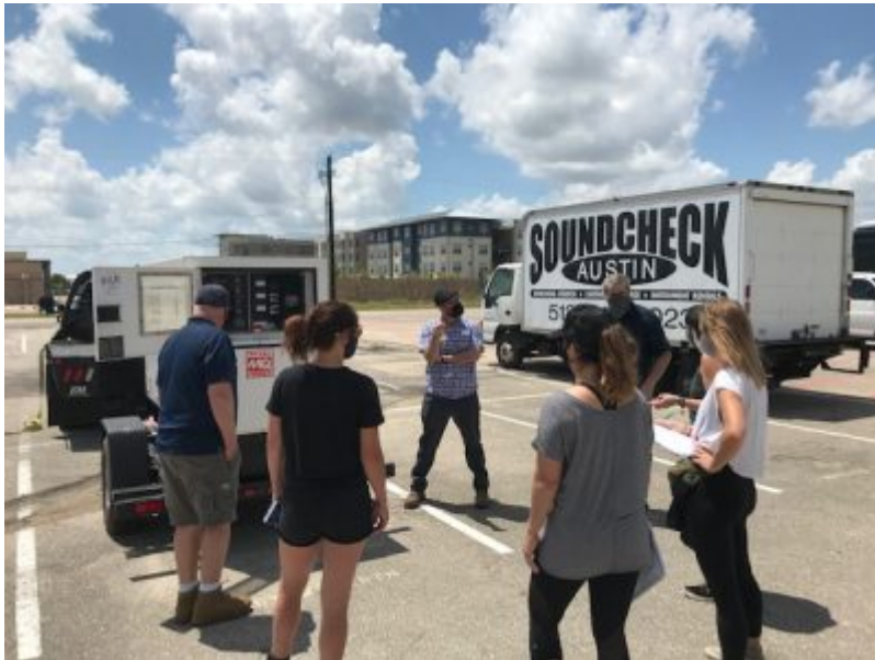
Learning how to power up / down a generator

While we all patiently wait out our moment to return to festivals and events, I thought this would be a good time to come together and utilize our collective experiences and resources to create a set of hands-on (but socially distant) tutorial sessions for local event professionals.