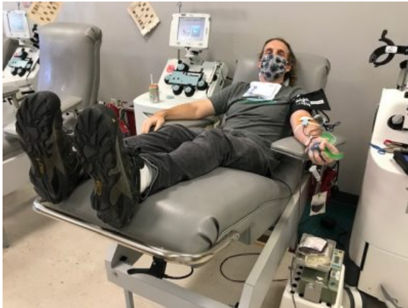
Giving blood in Austin at We Are Blood