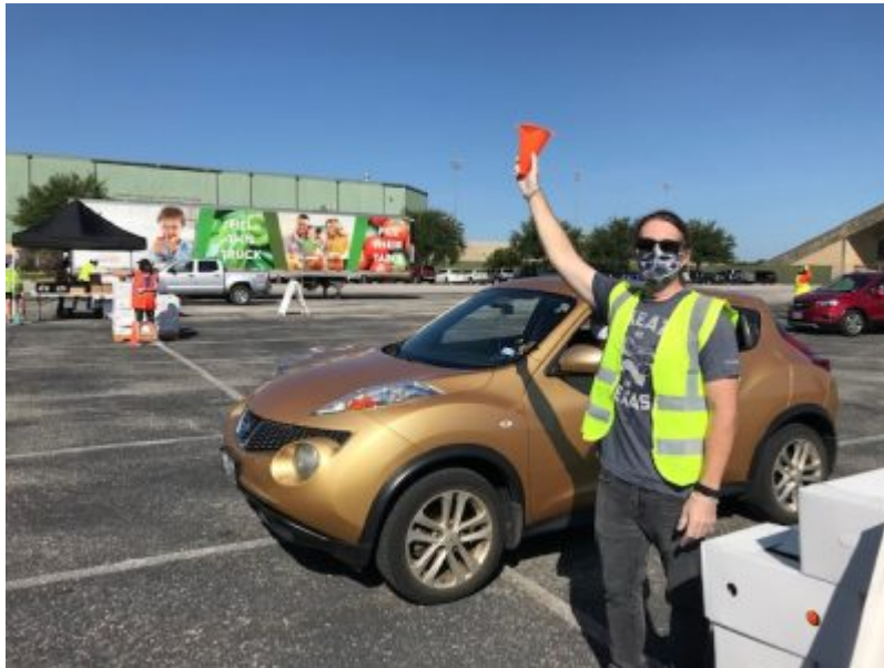
Volunteering at a mobile pantry for the Central Texas Food Bank