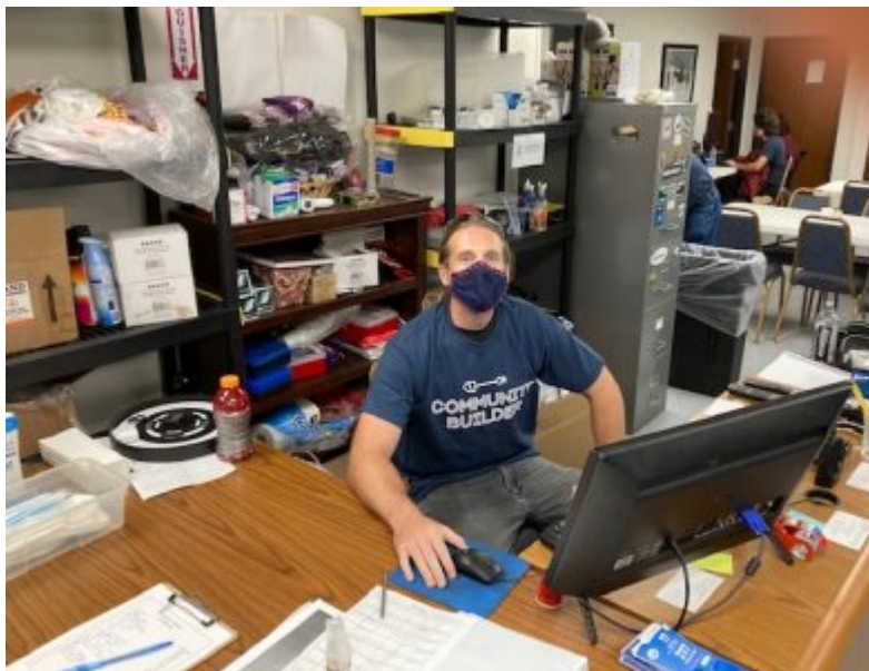
Manning the front desk at The Other Ones' headquarters at Camp Esperanza in Austin