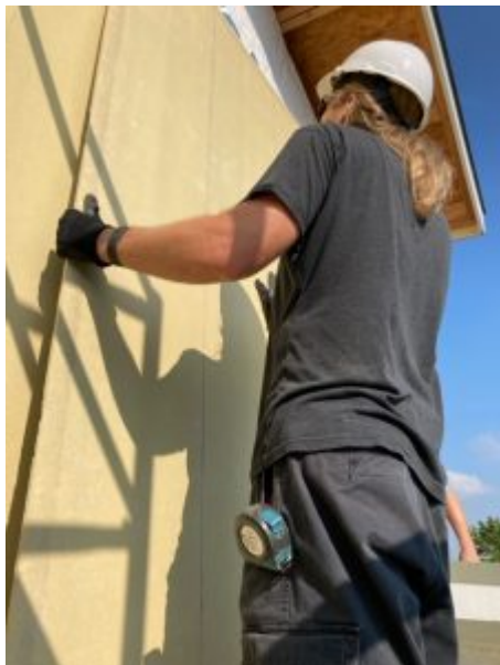
Hanging up siding at a HFH house in Austin