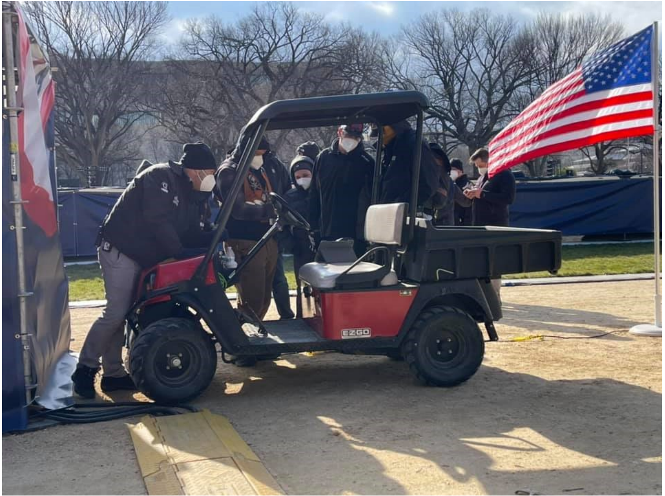
The Field of Flags Crew Watching the Inauguration Live from their iPad