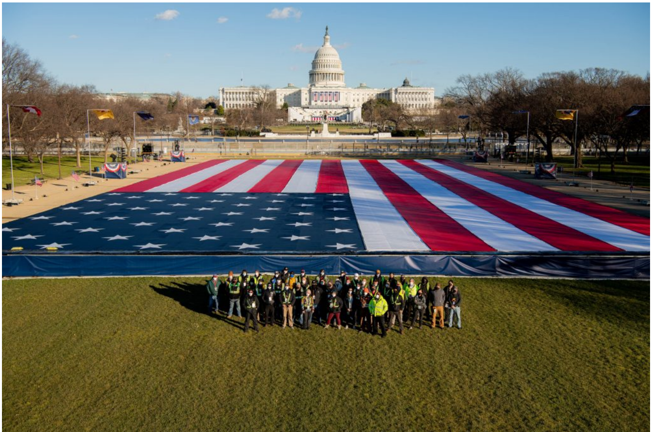
The C3 and Front Runner Productions Teams at the 2021