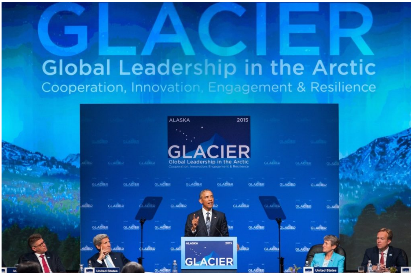
GLACIER Summit in Alaska