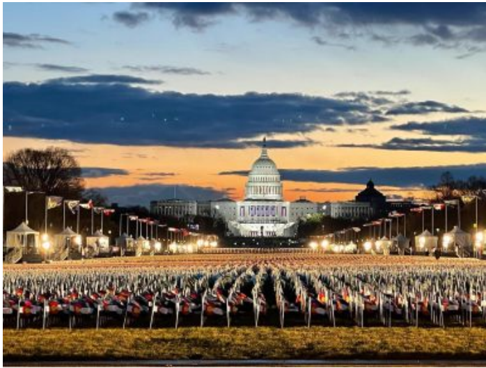
The Field of Flags at the 2021 Biden Inauguration at Sunrise