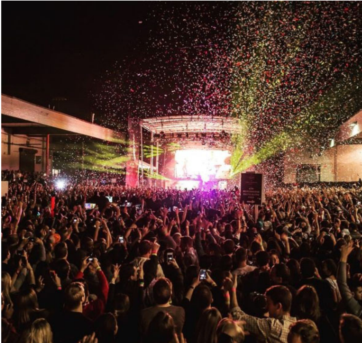
All Things Go Music Festival – Washington DC