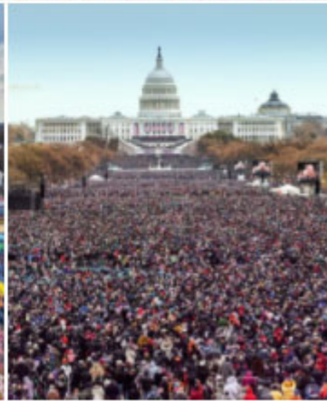
The 2013 and 2021 Inaugurations