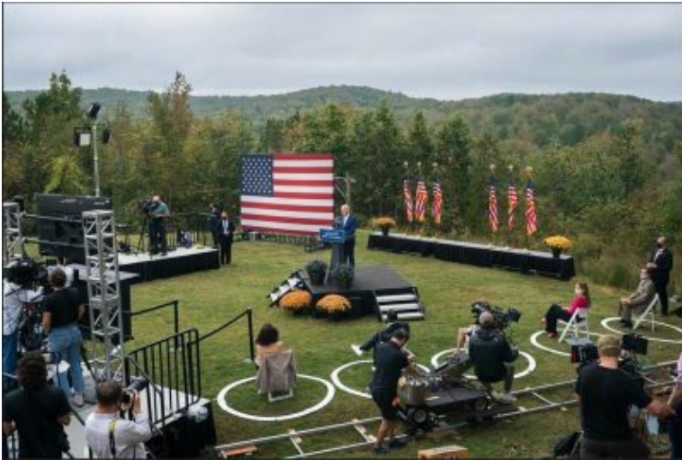
A 2020 Biden Rally, with Social Distancing Pods

We cover how they were able to adjust their business and their events once the pandemic hit, how they made their 2020 political events & rallies COVID-Safe, and go into detail on what it was like working the Inauguration with the extra security measures, cold weather, and reuniting with their longtime friends and colleagues. We also hear about what they're up to now and what they are looking forward to later in 2021.