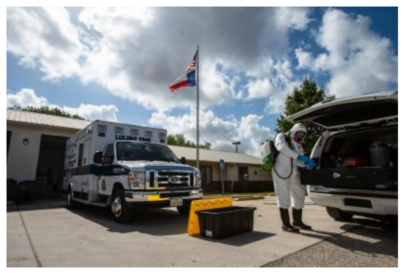
Code 4 Medical Services