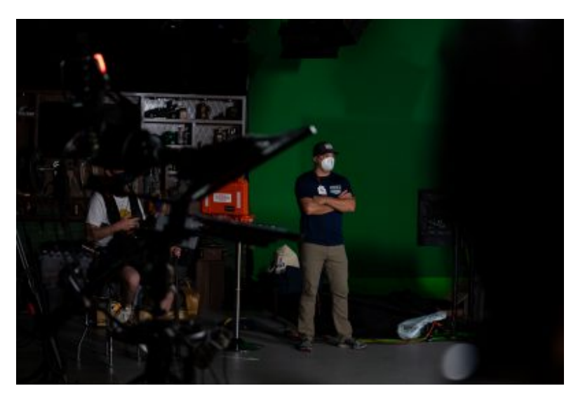
Code 4 Overseeing Compliance During a Movie Shoot