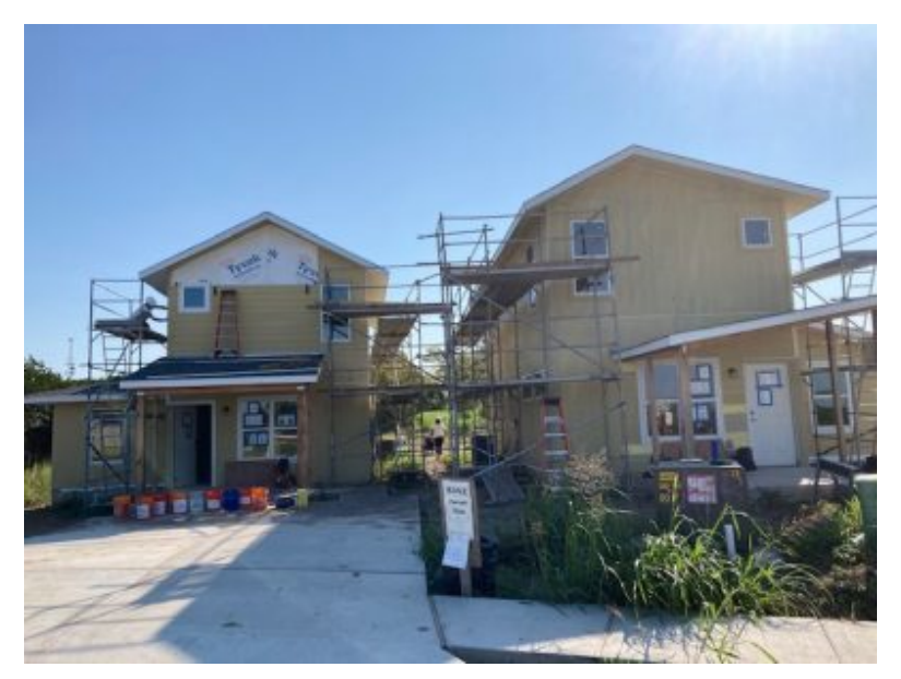
Habitat: Two of the House Builds