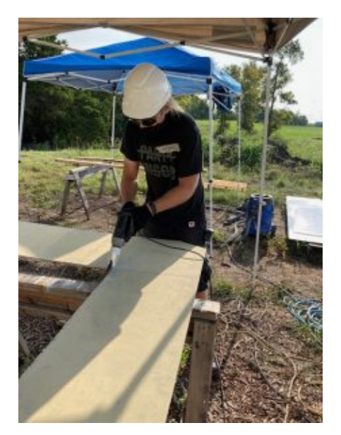
Habitat: Sawing Sheets