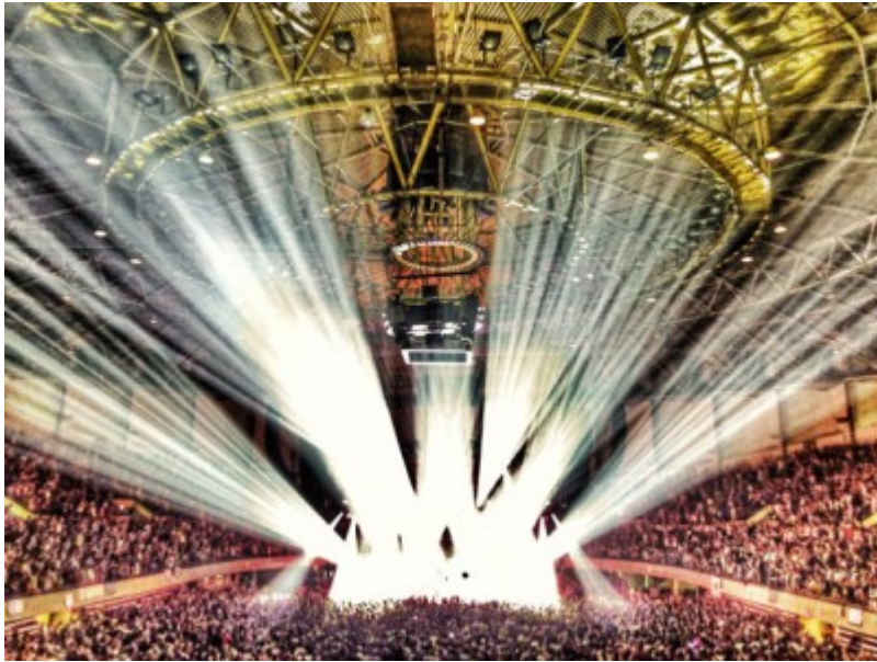
Phish in Hampton, VA, with LD Chris Kuroda utilizing the Grand MA 2 Consoles