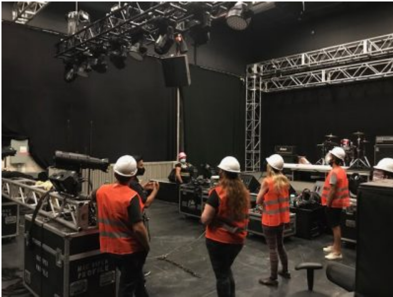
Learning how to tie rigging knots