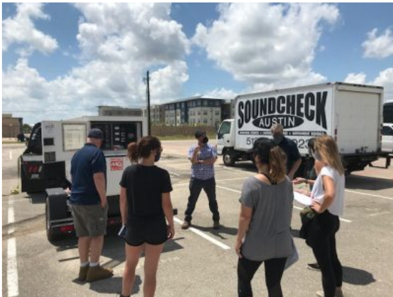
Learning how to power up / down a generator

While we all patiently wait out our moment to return to festivals and events, I thought this would be a good time to come together and utilize our collective experiences and resources to create a set of hands-on (but socially distant) tutorial sessions for local event professionals.